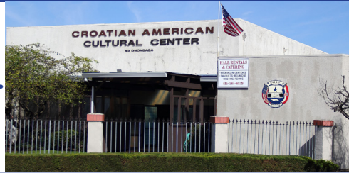
CACC

60 Onondaga Avenue at Alemany Boulevard San Francisco, California 94112 ♦ 415-584-8859